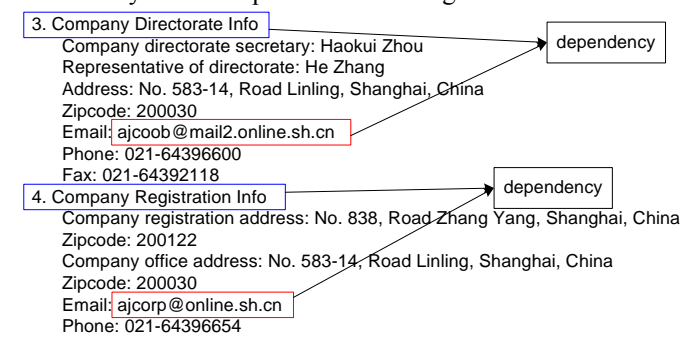
Fig 1. Example of Hierarchical laid-out information

sequence, and thus viewed as linearly laid-out [20]. In this paper, we concentrate on semantic annotation on hierarchically laid-out information that we name as hierarchical semantic annotation . In hierarchical semantic annotation, information is laid-out hierarchically. An example is shown in Figure 1.