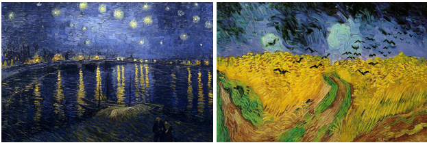
Figure 2: Van Gogh’s mood. Left: “Starry Night over the Rhone”. The top three predicted categories by our model are casual, modern, and chic. Right: “Wheat field”. The top three predicted categories are casual, dapper, chic.

and then remove each kind of features out of the PFG model and evaluate the performance reduction (shown in Table 3). We can see that all the features have contributions to infer affects. Furthermore, HSV feature is most useful in terms of Precision which achieves a 8.88% reduction, while saturation and brightness features are the most helpful features in terms of Recall and F1-Measure . More importantly, the analysis confirms that the network information is one of the most important features. Without considering the network information, the F1-Measure drops 6.55%.